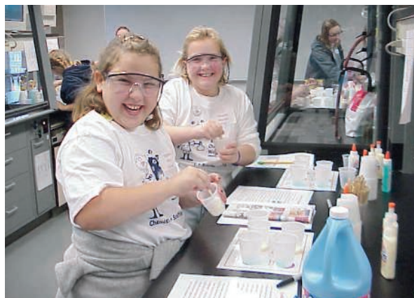
Members of Troop 511 make "incrediblobs" in the Magic of Chemistry program.

Chemistry of Color (8). Each utilizes American Chemical Society materials that reflect National Science Education Standards (14–17), specifically Standard A: Science as Inquiry. Workshops provide specific questions and data collection protocols to guide investigations. The girls formulate explanations from evidence, connect explanations to scientific